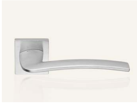
CS cromo satinato satin chrome