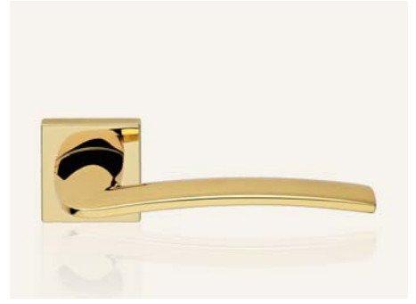
OL ottone lucido verniciato polished brass