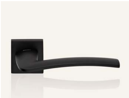
VE nero opaco matt black