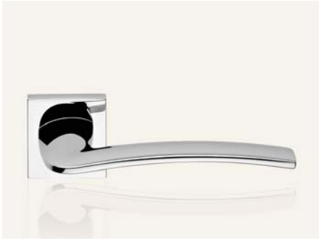
CR cromo lucido polished chrome